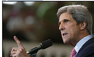
Sen. John F. Kerry (D-Mass.) has raised and donated millions of dollars.